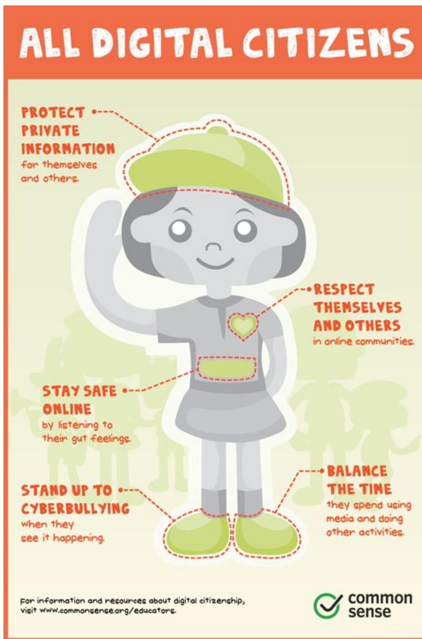
Figure 2. All Digital Citizens (Common Sense Education, 2018)

This website is an incredible resource for educators at any grade level. They even have a section for parents to log on with suggestions and tips on how to better support their children in this technological age. Common sense education is not the only source out there either.