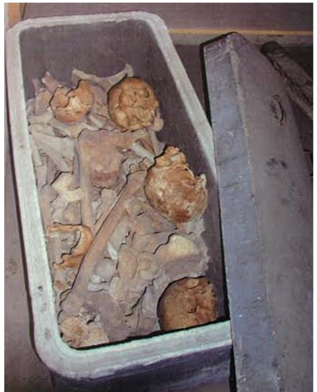
Image found in file at Hamline University's Osteology Laboratory associated with Acacia Park Cemetery sample depicting what is believed to be the vault that contained this skeletal sample.