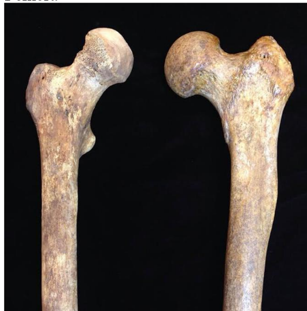
Figure 3. Illustration of Differences in American Indian and American White/Black Femora

The femur on the left shows the typical morphology of an individual of American White or Black ancestry and the femur on the right shows the typical morphology of an individual of American Indian ancestry. Note the presence of lateral flaring on the American Indian individual and absence of the American White/Black individual.